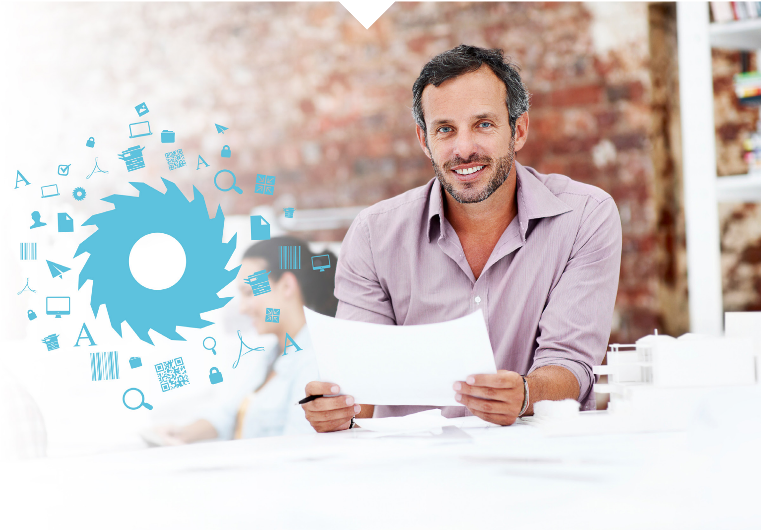
Image Capture & Routing

High performance, intelligent scanning software. It's a programmable ignition system for your imaging workflow.